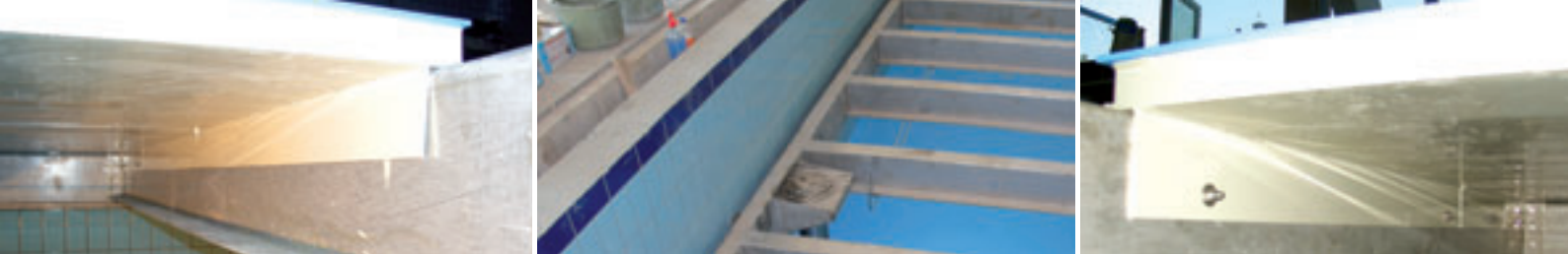
Fig. f.l.t.r.: Swimming pool floor welded to mounting panel, steel frame for hydraulic unit, bolted swimming pool floor.