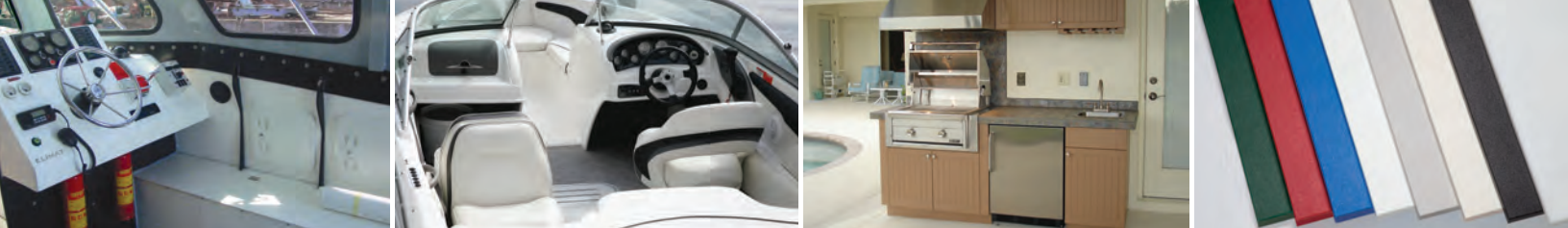
SIMONA® HDPE Boat Board offers exceptional flatness, stability and consistency in machining and fabrication.